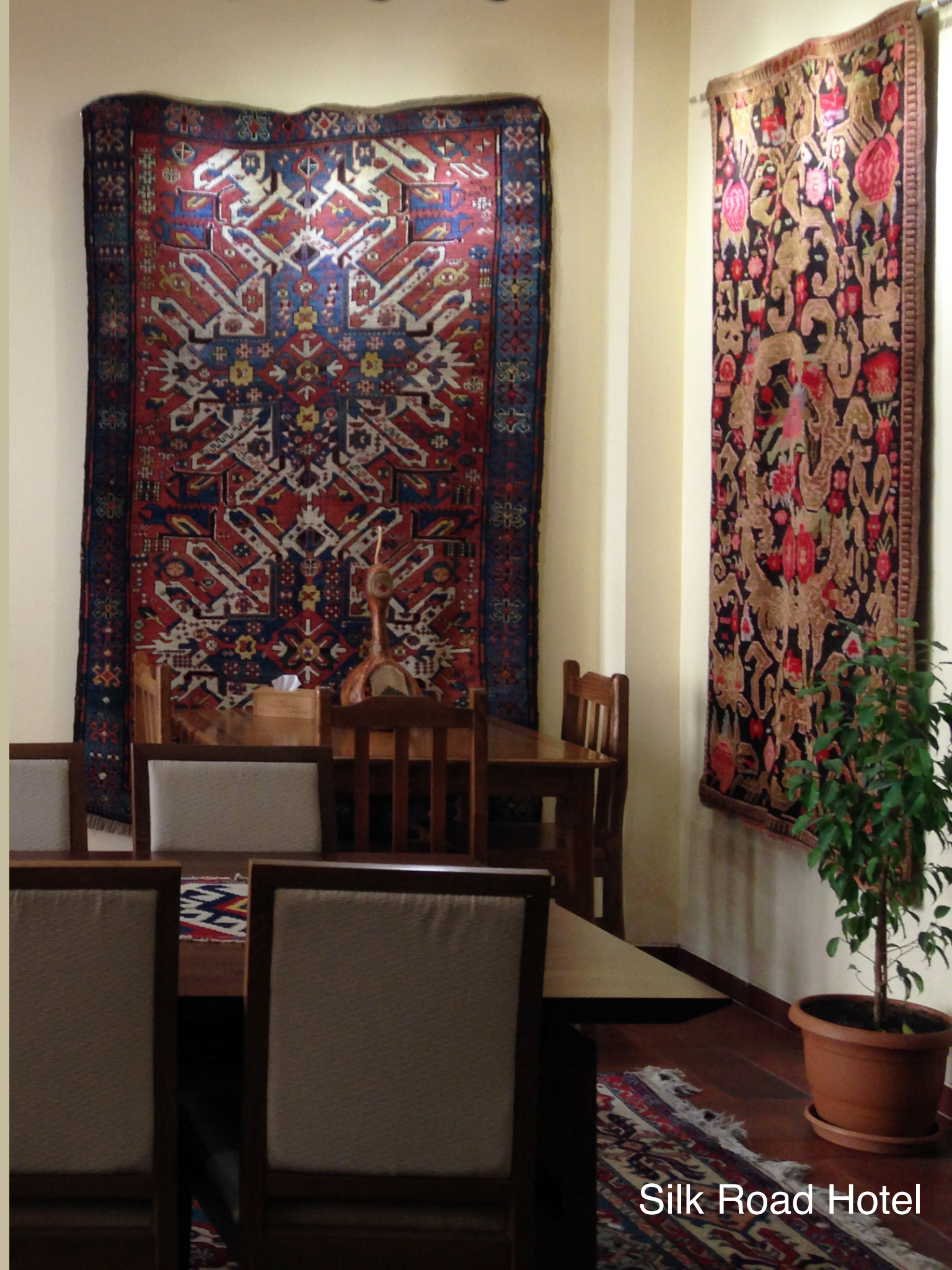
Silk Road Hotel

The spirit of music making is an inclusive activity and Music of Armenia with its broad range of projects helps define new pathways and lay strong foundations for live music events in Armenia.